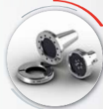
Taper Supporting ring